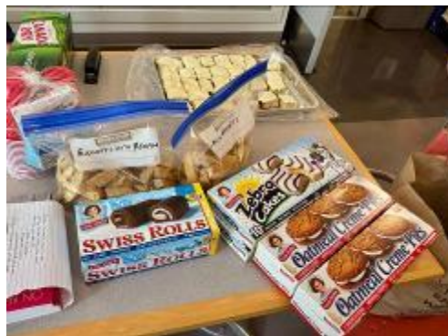
Homemade biscotti will be much appreciated by the tea and coffee drinkers!