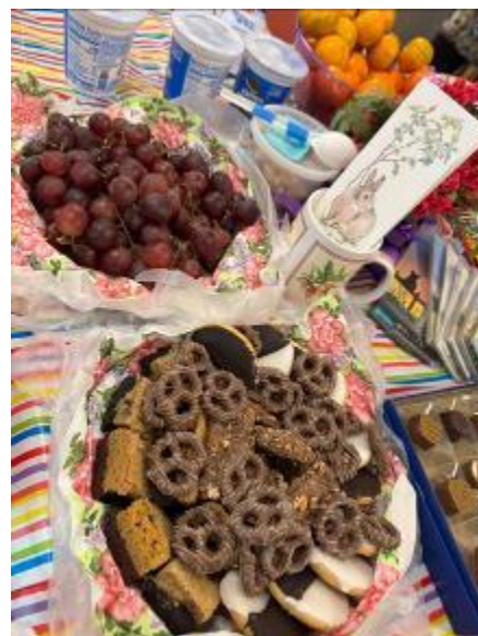
What a spread, eh?