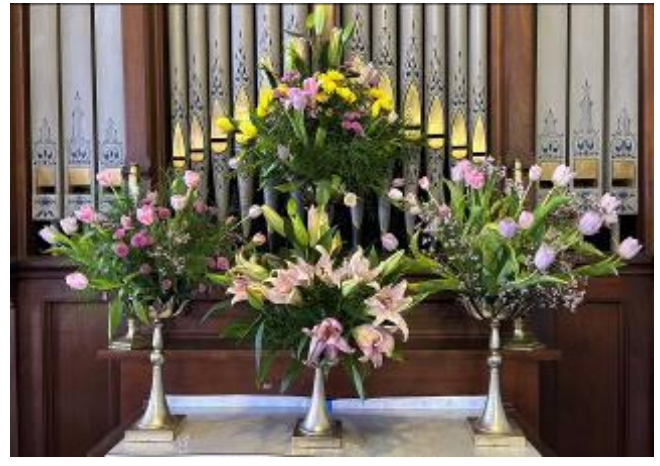
Easter Flowers, pictures courtesy of Janet Tuttle