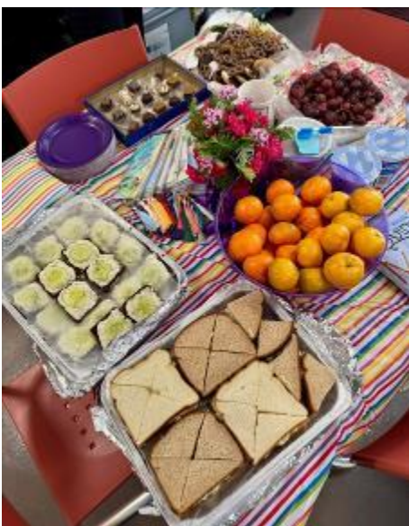
It was really hard not to sample the wares.